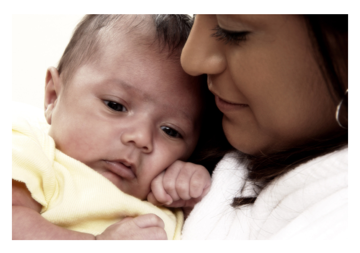
"My baby and I are staying away from the room that my husband is fixing up."