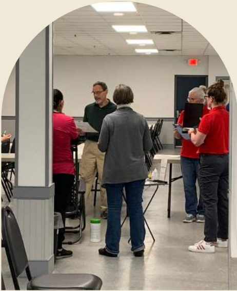
RAMRC receives a briefing for the start of Middlebury's Dental Pop-Up Clinic.