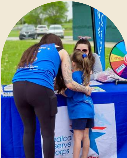
NWVTMRC tables at the NCSS Autism Walk.