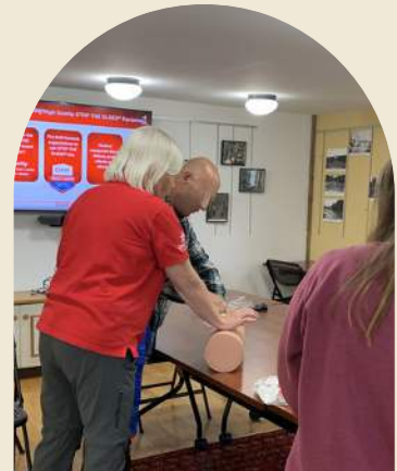
RAMRC teaches a STB course.