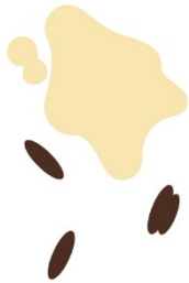
Rodent droppings or urine stains

Check for signs of pests in and around your home or building. Look for: