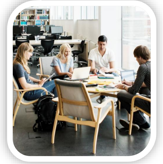
Educational Support Groups

Student assistant professionals (SAPs) often coordinate prevention initiatives in schools. Looking ahead: VDH will continue to standardize the SAP role.