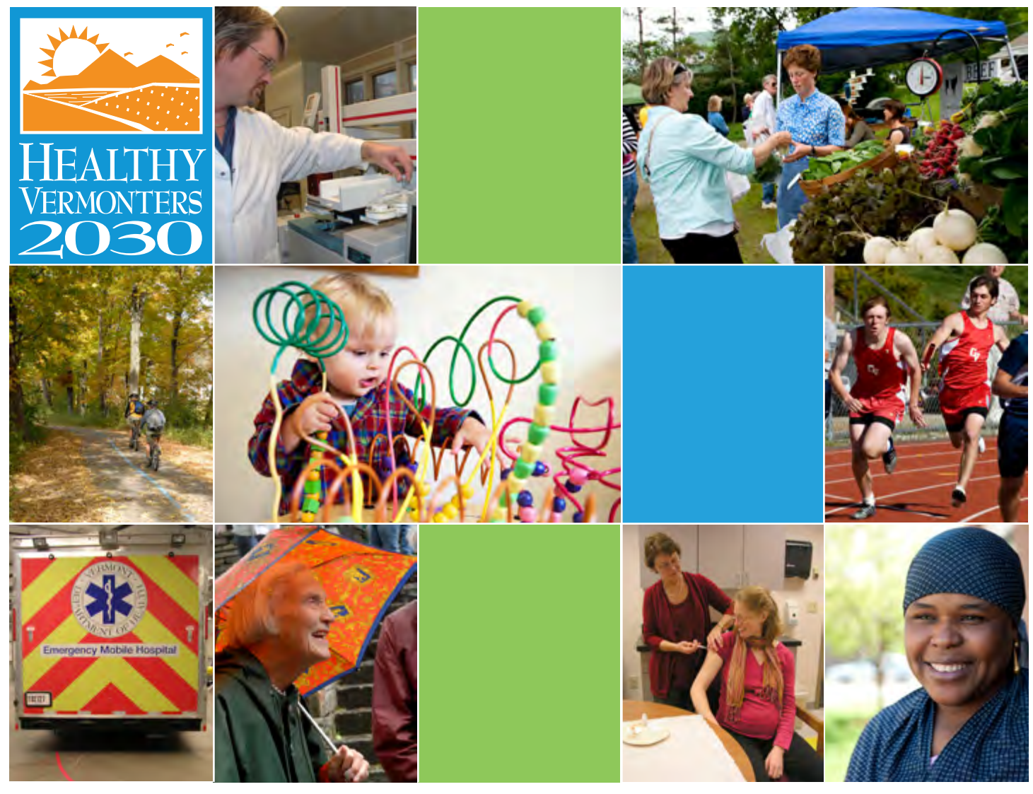
Public Health in Vermont