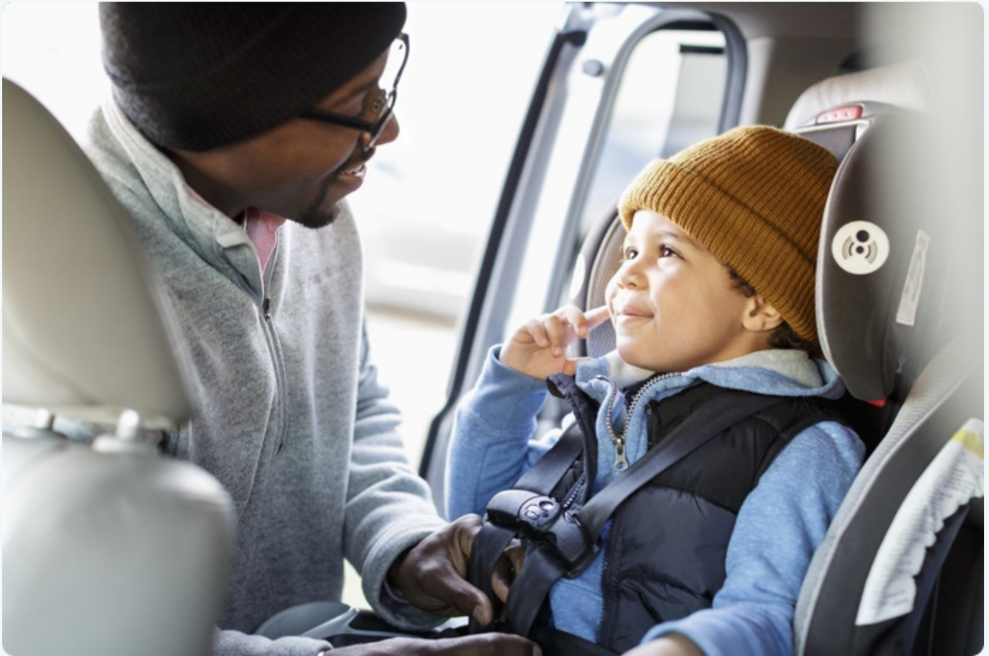
Parent wearing black hat, glasses, and grey sweatshirt, leaning into car, securing toddler into booster car seat.