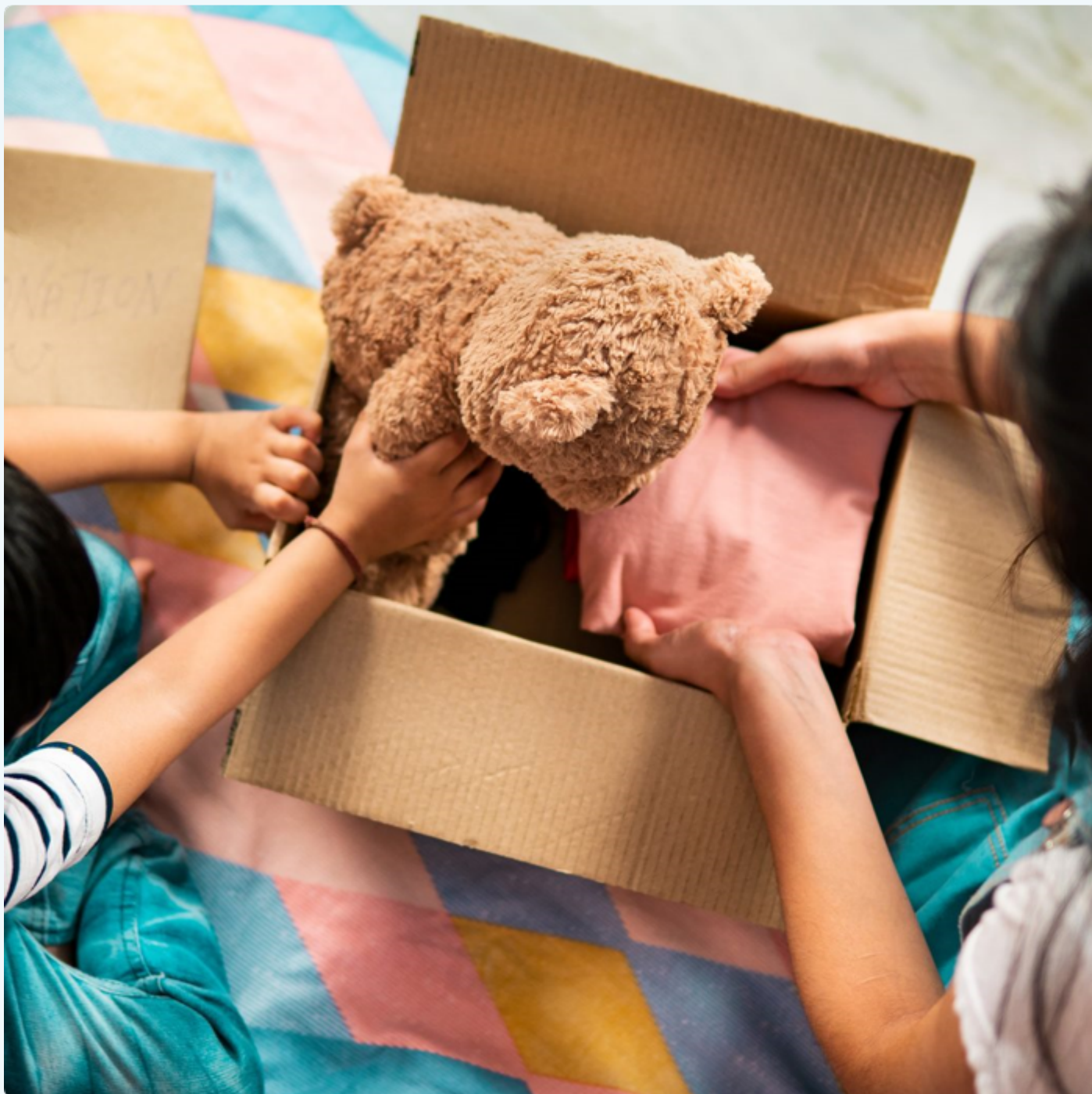
Two children packing a tan teddy bear into a tan moving box.