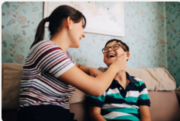
Adult sitting with child on sofa. Both wearing striped shirts. Child wearing glasses.