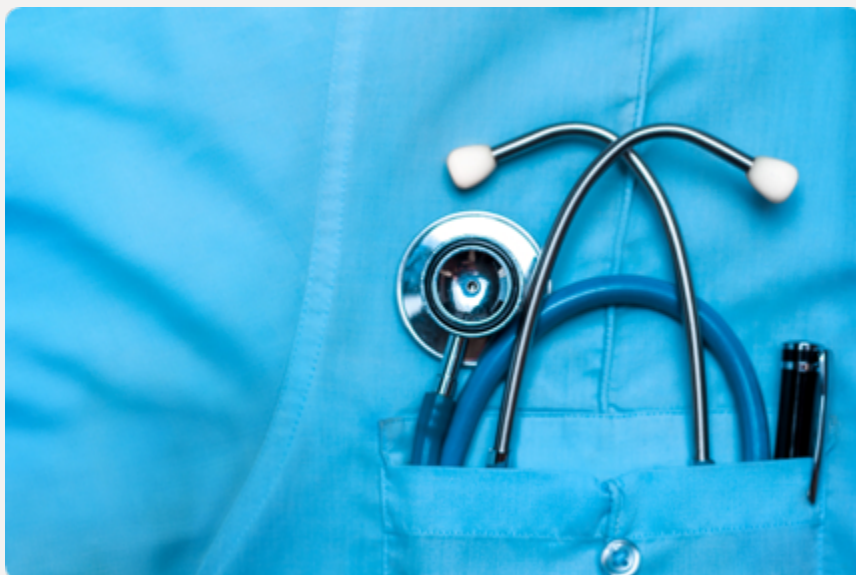
Light blue scrubs pocket containing stethoscope and pen.