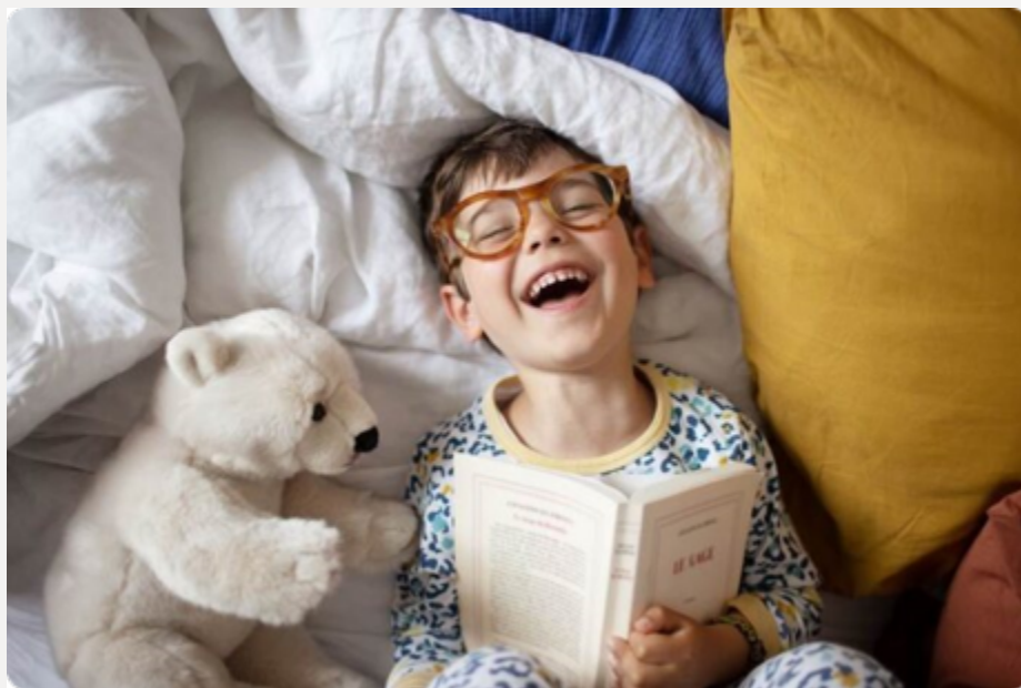
Child brown hair, brown glasses, laughing, reading book in bed next to stuffed polar bear toy.