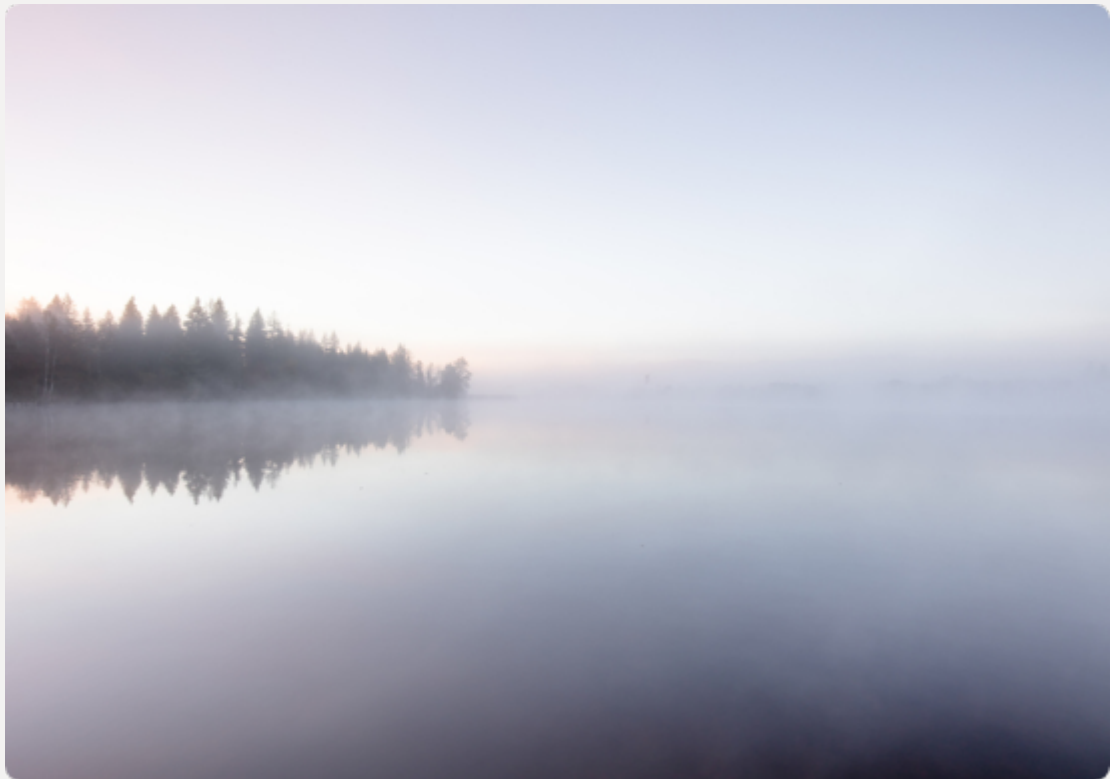
Sunny day, grey fog over water and pine trees.