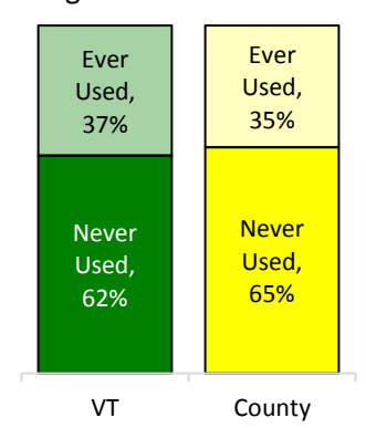
Frequency of Marijuana Use, Past 30 days

Marijuana Use Among High School Students