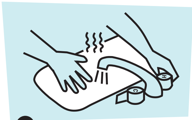
1 Use warm water.