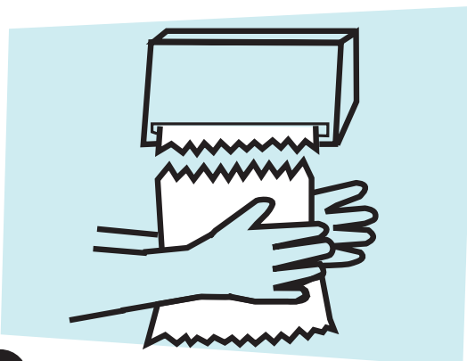
5 Dry hands.