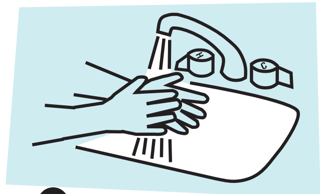
4 Rinse thoroughly.