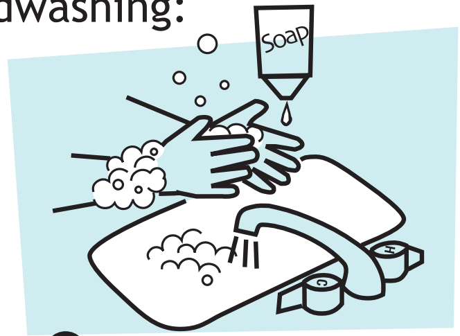
2 Moisten hands/apply soap.