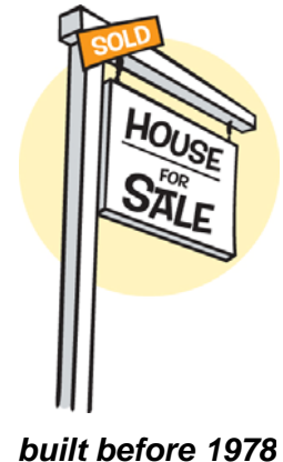
built before 1978