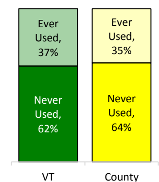
Frequency of Marijuana Use, Past 30 days

Marijuana Use Among High School Students